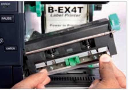
Snap-in printhead reduces maintenance downtime to a minimum

The unique intuitive graphical LCD 'helpdesk' display improves usability and prompts even the novice user to take immediate corrective action where necessary, keeping user training to a minimum.