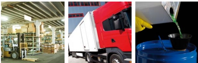
* The B-EX4T2 was benchmarked against competitor products in stand-by mode.

The B-EX4T2 is available in either 203/300 or 600dpi variants, allowing for specialist high resolution printing with superior print quality.