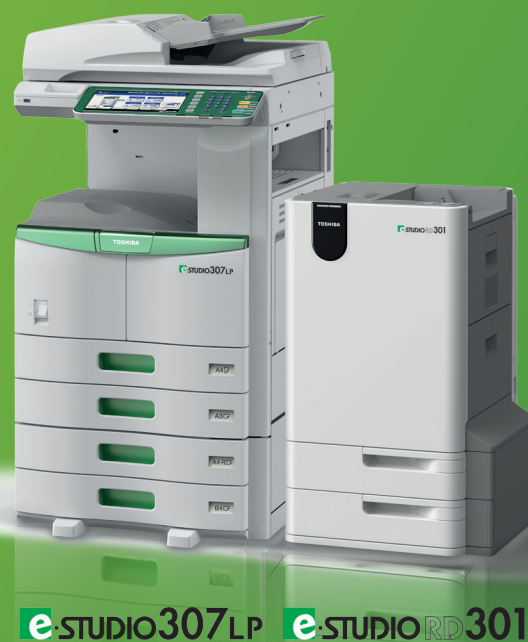
e-STUDIO307LP e-STUDIO RD301