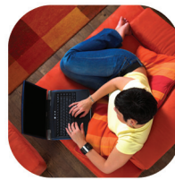
Off Campus Home