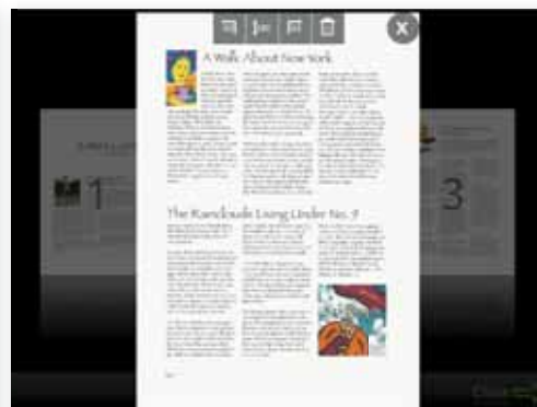
Preview and edit