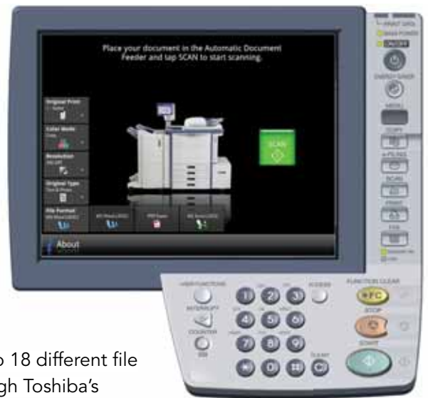
Advanced User Interface