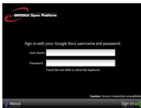
Secure authentication with Google™ Docs

*Can be uploaded but not viewed in Google™ Docs